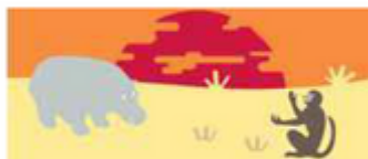
Savannah theme (4 pictures)