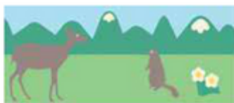
Altitude theme (4 pictures)