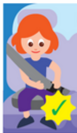
7. I always wear my seat belt in the car.