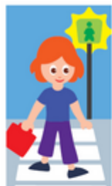
1. I cross the road at a pedestrian crossing.