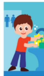
9. I always wash my hands after using the toilets.