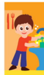
6. I always wash my hands before eating.