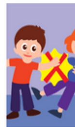
10. No pushing.