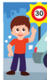
3. 30 mph, that's the urban speed limit.