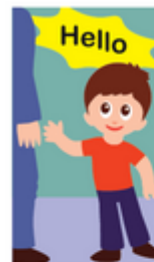
4. I always say, 'Hello'.