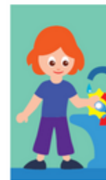
11. I never leave the tap running.