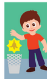
5. I always put my rubbish in the bins provided.