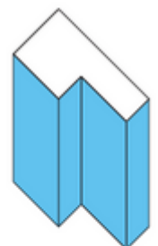
Thermoforming Complex frame protection