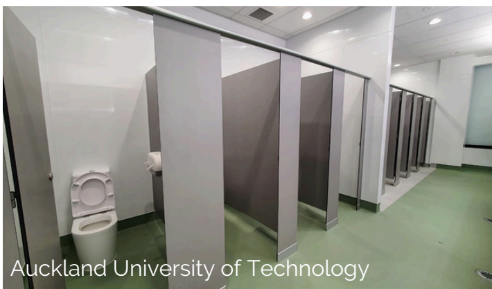
Auckland University of Technology