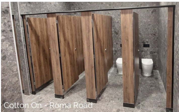
Cotton On - Roma Road