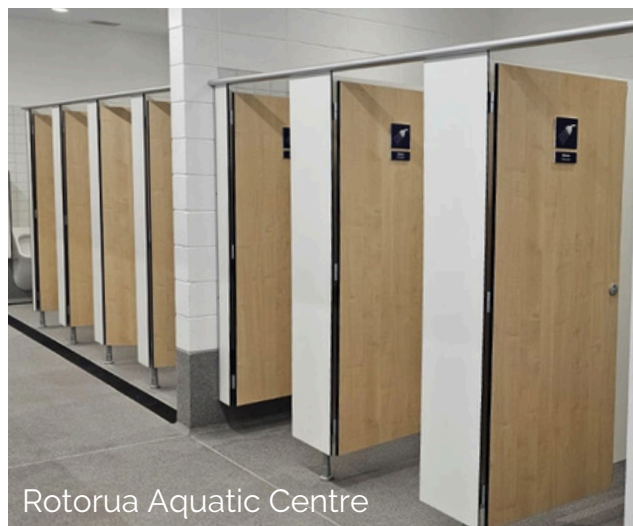
Rotorua Aquatic Centre

The Urban Range is available in the DuraLam Panel. Antibacterial Compact Laminate eliminates the growth of nearly 99% of common forms of bacteria on any surface.