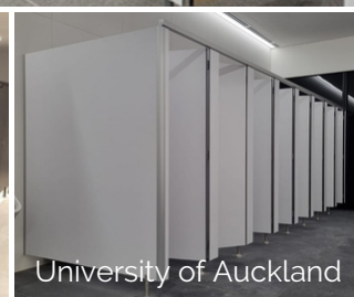
University of Auckland